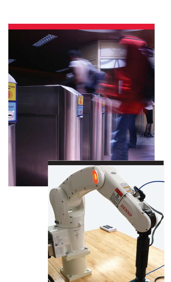
Mobile and contactless testing.